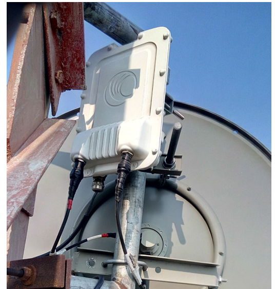
PTP 650 with Antenna

The PTP 650 link was tested by engineers from both AIM Enterprises and BSNL as a pilot project. Once established, the link was turned over to BSNL and the local government. In addition to higher performance, the PTP 650 delivered connectivity at a substantially lower cost than alternative technology. The system has saved approximately $37,500 USD per year.