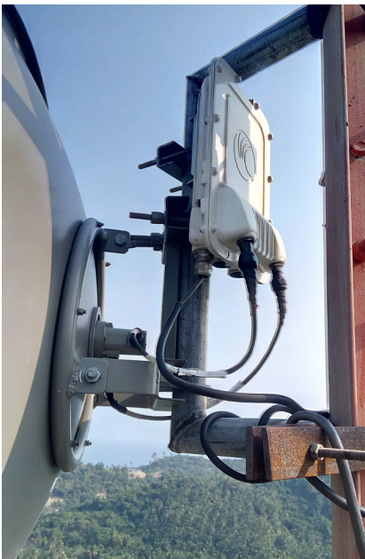
Neil Island link