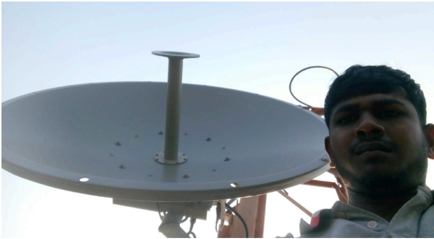
Technician installing the link