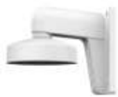
DS-1272ZJ-110-TRS Wall Mount