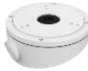
DS-1281ZJ-S Inclined Base Mount