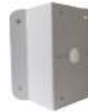
DS-1276ZJ Corner Mount