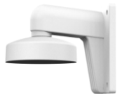
DS-1272ZJ-110-TRS Wall Mounting Bracket