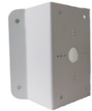
DS-1276ZJ Corner Mounting Bracket