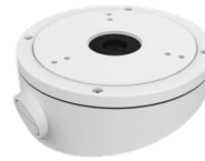
DS-1281ZJ-S Inclined Base Mounting Bracket