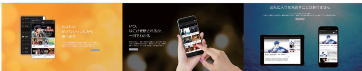
“GYAO!” is a free video delivery service operated in conjunction with Yahoo’s subsidiary, GYAO Corporation.